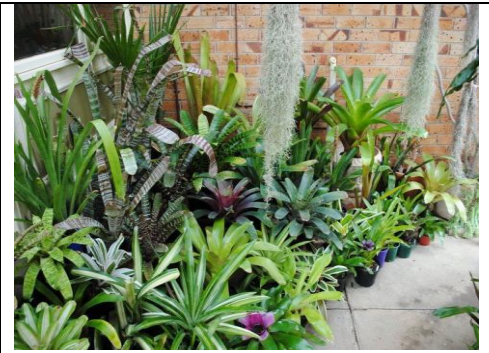
Rhonda & Geoff's garden