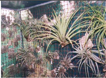
Len Colgan's garden