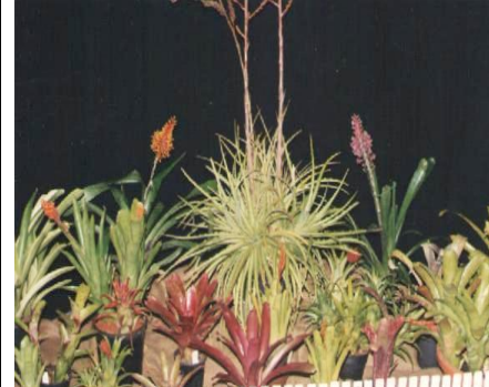
BSSA Oct show 1996