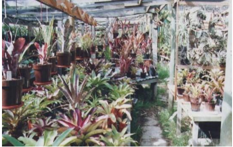
Butchers garden 1991