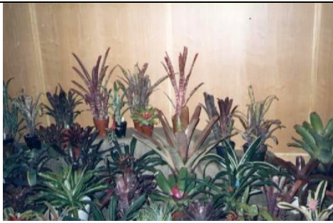
Adelaide conference 1987