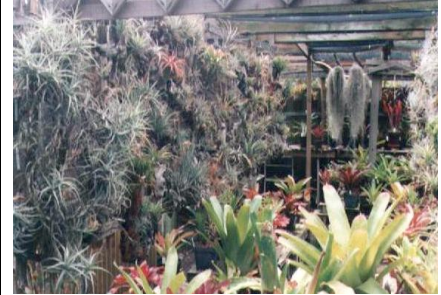
Butchers garden 4/95