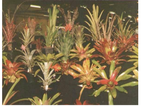
Royal show display 1996