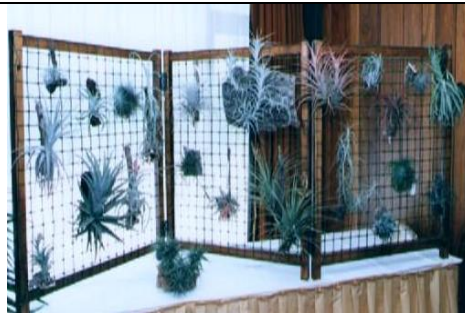
Till display conference 1987