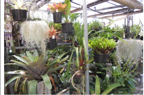
One of Ron & Bev's display areas