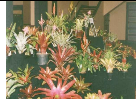
Royal Show display 1995