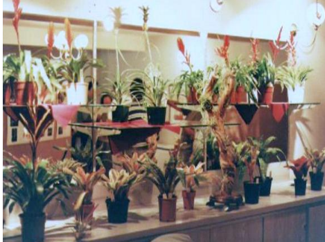
Conference display 1995