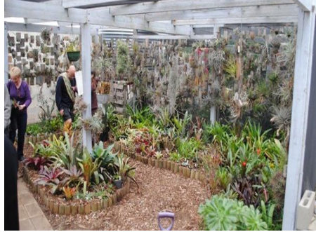
Bill's Garden @ Bute