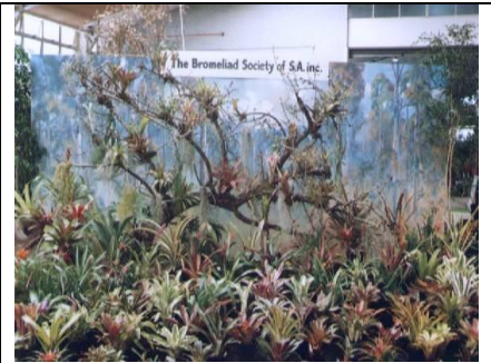
Adelaide show display