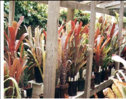
Butchers Billbergia garden 1999

Named by Harry Luther in 1995. (In honor of Derek )This plant has been grown in 1980 from seed from K.Knize. Plants flowered in 1990 but it ws not until 1992 that a piece "borrowed" from the type specimen in Len Colgan's collection