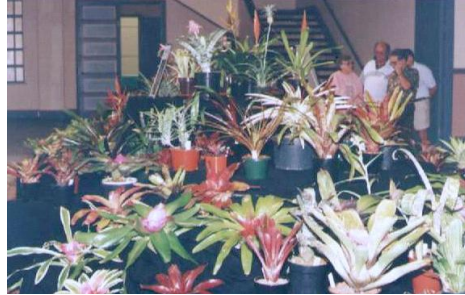
Royal Adelaide show 1995