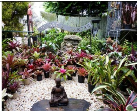
Jeanne's in memoria garden